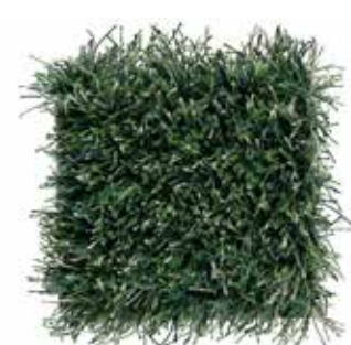
Sea Green 350