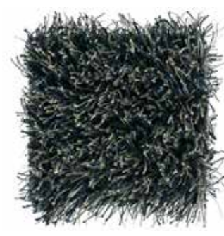
Ink Blue 521