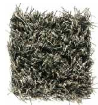
Dark Grey 1