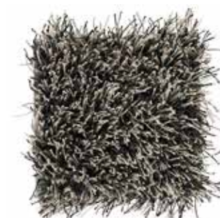
Mottled Black 580